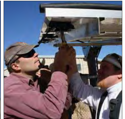
Students participate in the CNM PV Installation classes.