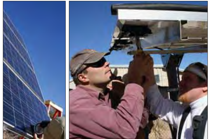
Students participate in the CNM PV Installation classes.